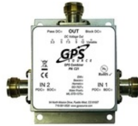
C21 GPS Signal Combiner