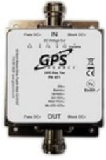
GPS Bias Tee (BT1)