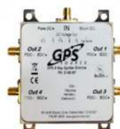
GPS 1X4 Timing Splitter (S14S)