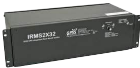
GPS 2X32 Intergrated Rack Mount Splitter (IRMS232)