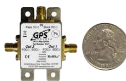
GPS 1X2 Timing Splitter (S12T)