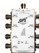
GPS 1X8 Timing Splitter (S18-A)