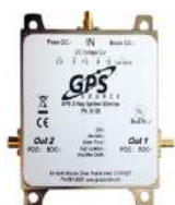
GPS 1X2 Timing Splitter (S12S)