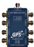
GPS 1X8 Timing Splitter (S18GT)