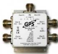
GPS 1X4 Timing Splitter (S14)