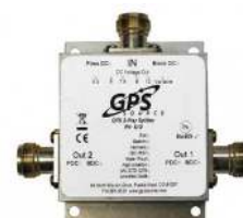
GPS 1X2 Timing Splitter (S12)