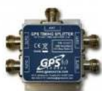
GPS 1X4 Timing Splitter (S14GT)